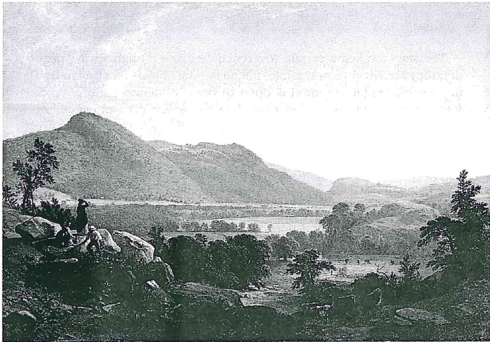
Dover Plains, Dutchess County, New York (1848) by Asher Brown Durand. Oil on canvas (42 1/2" x 60 1/2").